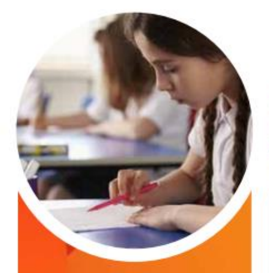
Children within our Trust will always be our main priority, with personalised learning as our starting point, making the challenges of 'Helping Children Achieve More' a reality.